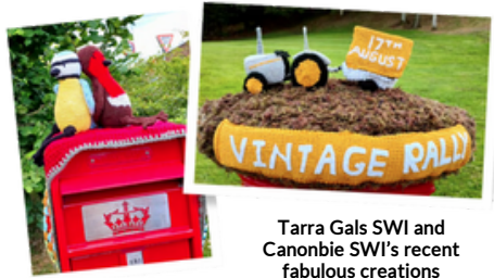
Tarra Gals SWI and Canonbie SWI's recent fabulous creations

By piggybacking on days like World Book Day or International Women's Day you can make your mark. Choose themes that really resonate with your community and go leafletting dressed as your favourite Agatha Christie character, woman of note, or Womble!