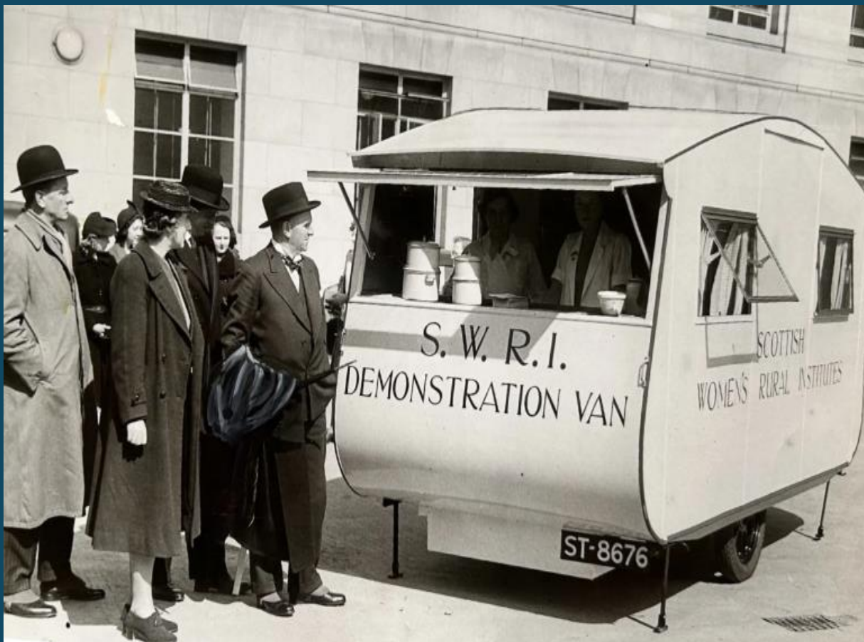
Scottish Home and Country, May 1940

Toured Scotland during 1940 to give advice on growing fruit and vegetables and the best ways of cooking and preserving them.