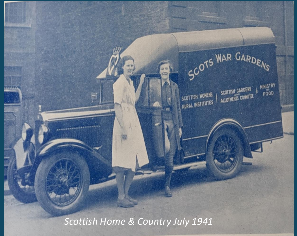
Scottish Home & Country July 1941